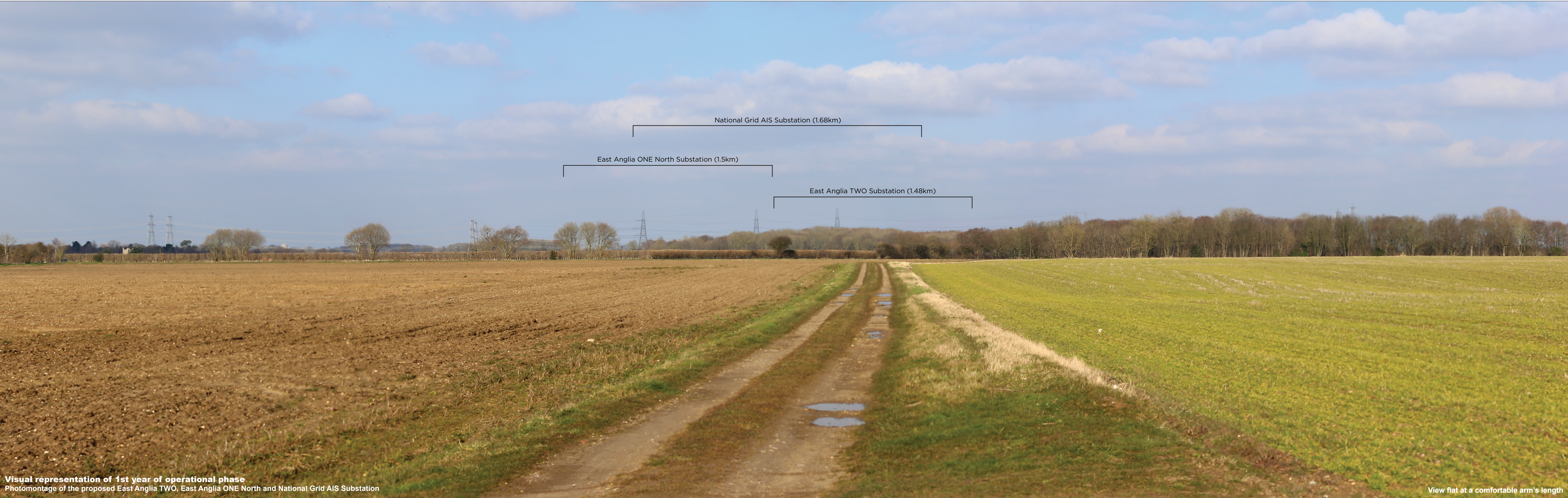
Visual representation of 1st year of operational phase Photomontage of the proposed East Anglia TWO, East Anglia ONE North and National Grid AIS Substation