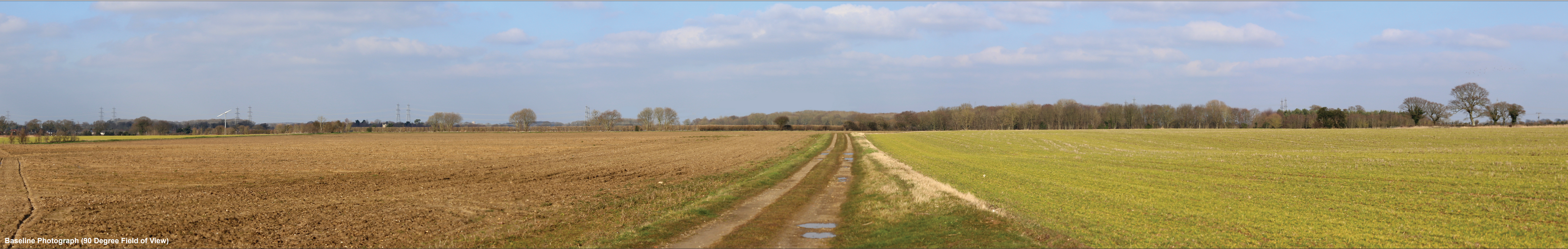
Baseline Photograph (90 Degree Field of View)