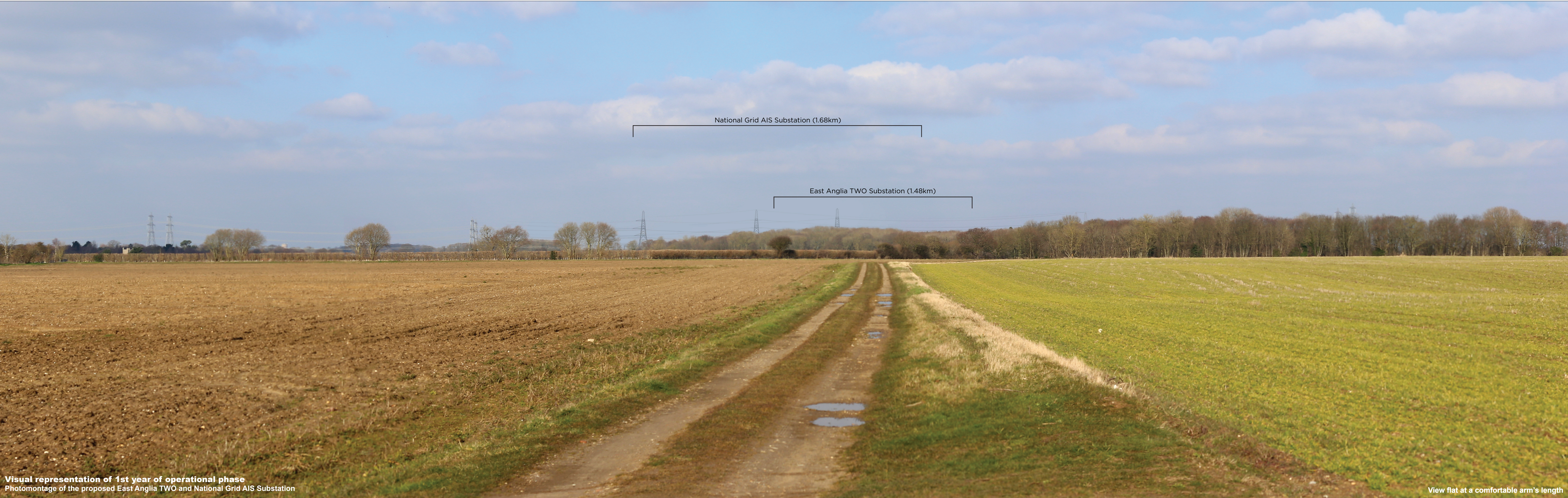
Visual representation of 1st year of operational phase Photomontage of the proposed East Anglia TWO and National Grid AIS Substation